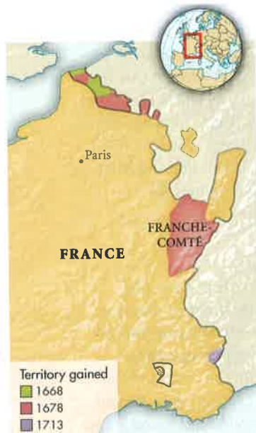
The Acquisitions of Louis XIV, 1668–1713

In Madrid, however, royal expenditures constantly exceeded income. To meet mountainous state debt, the Crown repeatedly devalued the coinage and declared bankruptcy, which resulted in the collapse of national credit. Meanwhile, manufacturing and commerce shrank. In contrast to the other countries of western Europe, Spain had a tiny middle class. The elite condemned moneymaking as vulgar and undignified. Thousands entered economically unproductive professions: there were said to be nine thousand monasteries in the province of Castile alone. To make matters worse, the Crown expelled some three hundred thousand Moriscos , or former Muslims, in 1609, significantly reducing the pool of skilled workers and merchants. Those working in the textile industry were forced out of business by steep inflation that pushed their production costs to the point where they could not compete in colonial and international markets. 6