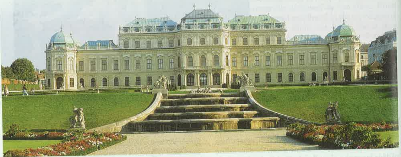
Prince Eugene's Summer Palace in Vienna.

Louis moved his court and government to the newly renovated palace at Versailles, a former hunting lodge. The palace quickly became the center of political, social, and cultural life. The king required all great nobles to spend at least part of the year in attendance on him there, so he could keep an eye on their activities. Since