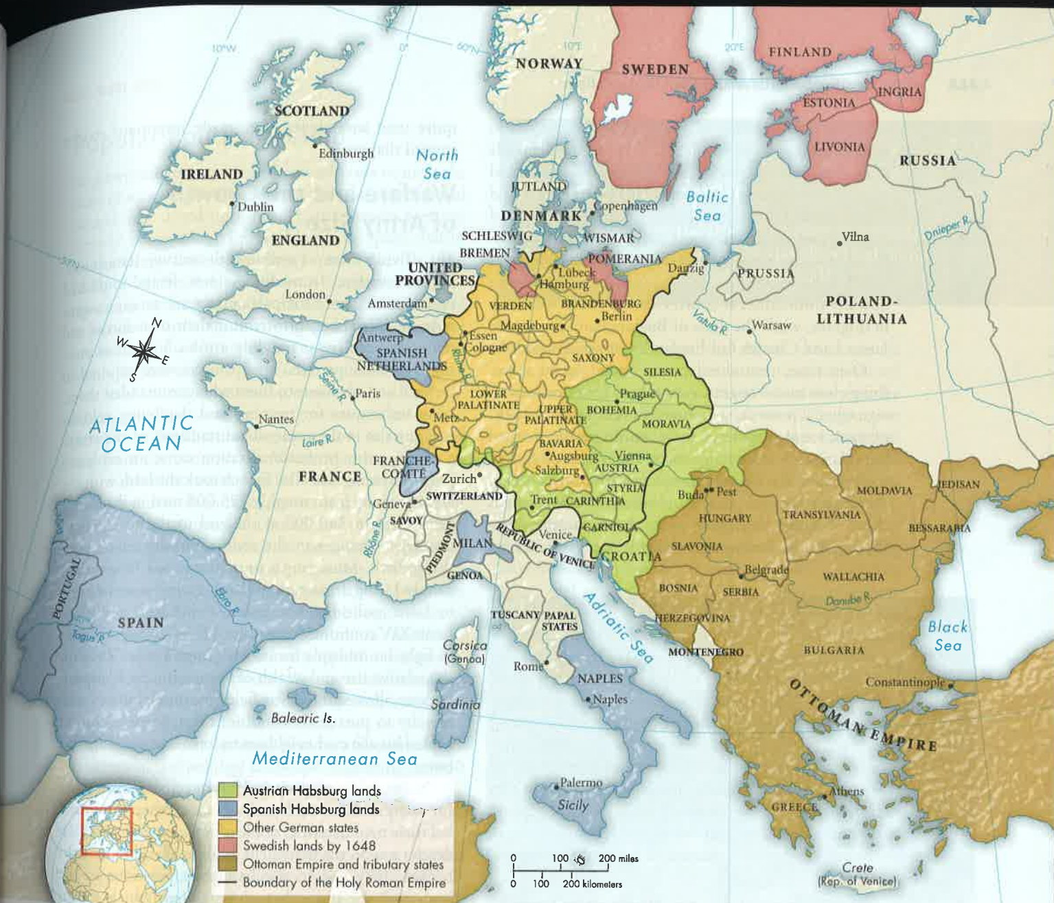
Map 15.1 Europe After the Thirty Years' War This map shows the political division of Europe after the Treaty of Westphalia (1648) ended the war. France emerged as the strongest power in Europe at the end of the Thirty Years' War. Based on this map, what challenges did the French state still face in dominating Europe after 1648? How does the map represent Swedish gains and Spanish losses in the Treaty of Westphalia?

tative institutions. More recently, historians have emphasized commonalities among these powers. Despite their political differences, all these states shared common projects of protecting and expanding their frontiers, raising new taxes, consolidating central control, and competing for the new colonies opening up in the New and Old Worlds.