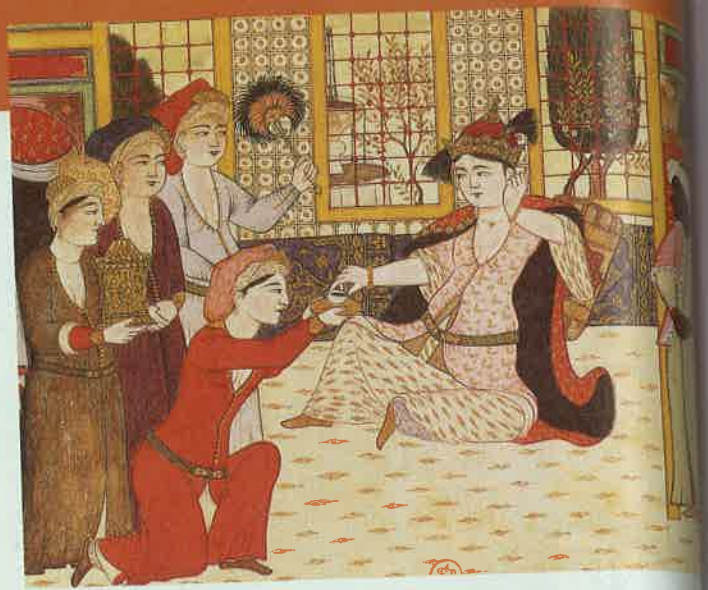
Hürrem and her ladies in the harem.

Hürrem used her enormous pension to contribute a mosque, two schools, a hospital, a fountain, and two public baths to Istanbul. In Jerusalem, Mecca, and Istanbul, she provided soup kitchens and hospices for pilgrims and the poor. She died in 1558, eight years before her husband. Her son Selim II (r. 1566–1574) inherited the throne.