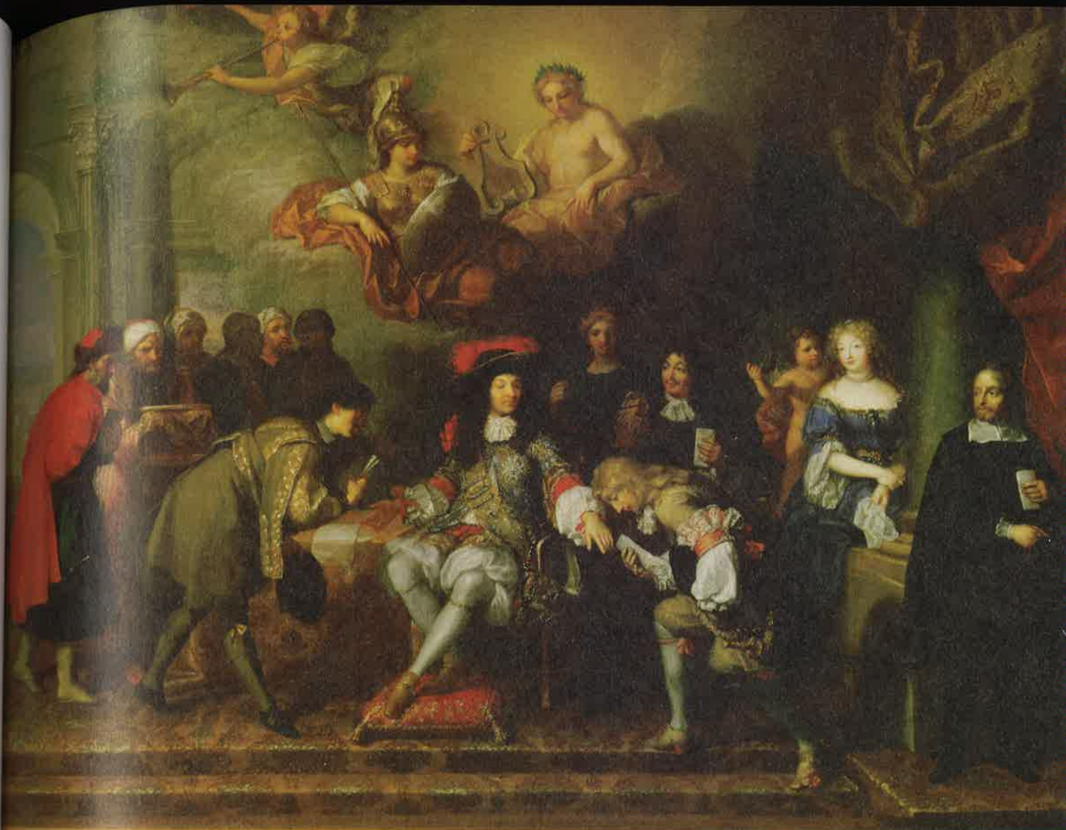
Life at the French Royal Court. King Louis XIV receives foreign ambassadors to celebrate a peace treaty. The king grandly occupied the center of his court, which in turn served as the pinnacle for the French people and, at the height of his glory, for all of Europe.