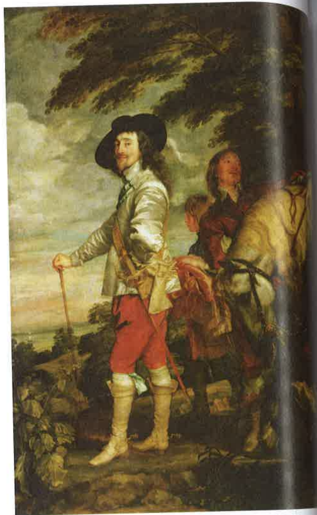
Van Dyck, Charles I at the Hunt, ca. 1635 Anthony Van Dyck was the greatest of Rubens's many students. In 1633 he became court painter to Charles I. This portrait of Charles just dismounted from a horse emphasizes the aristocratic bearing, elegance, and innate authority of the king. Van Dyck's success led to innumerable commissions by members of the court and aristocratic society. He had a profound influence on portraiture in England and beyond; some scholars believe that this portrait influenced Rigaud's 1701 portrayal of Louis XIV (see page 471).

process of law. James I and his son Charles I (r. 1625–1649) considered such constraints intolerable and a threat to their divine-right prerogative. Consequently, bitter squabbles erupted between the Crown and the House of Commons. The expenses of England's intervention in the Thirty Years' War, through hostilities with Spain (1625–1630) and France (1627–1629), only exacerbated tensions. Charles I's response was to refuse to summon Parliament from 1629 onward.