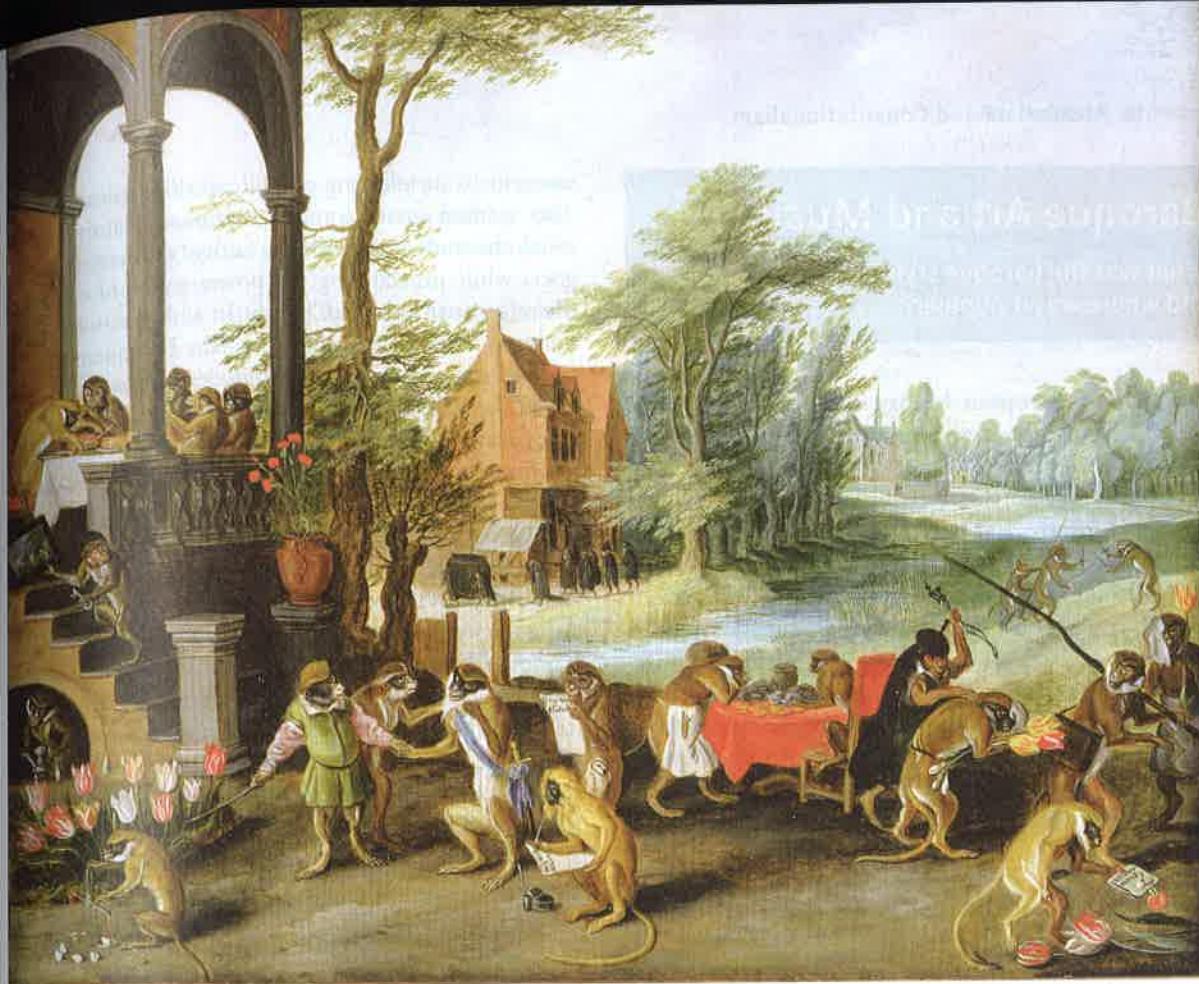
Satire on Tulipmania This painting mocks the speculative boom in tulips that hit the Dutch Republic in the 1630s. The left side of the image depicts a group of monkeys dressed as wealthy investors engaged in buying and selling tulips. On the right side, investors experience the pain of the crash, as one monkey urinates on a worthless tulip and another is brought to trial for debt.

assembly, or States General, handled foreign affairs and war, but it did not possess sovereign authority. All issues had to be referred back to the local Estates for approval, and each of the seven provinces could veto any proposed legislation. Holland, the province with the largest navy and the most wealth, usually dominated the republic and the States General.