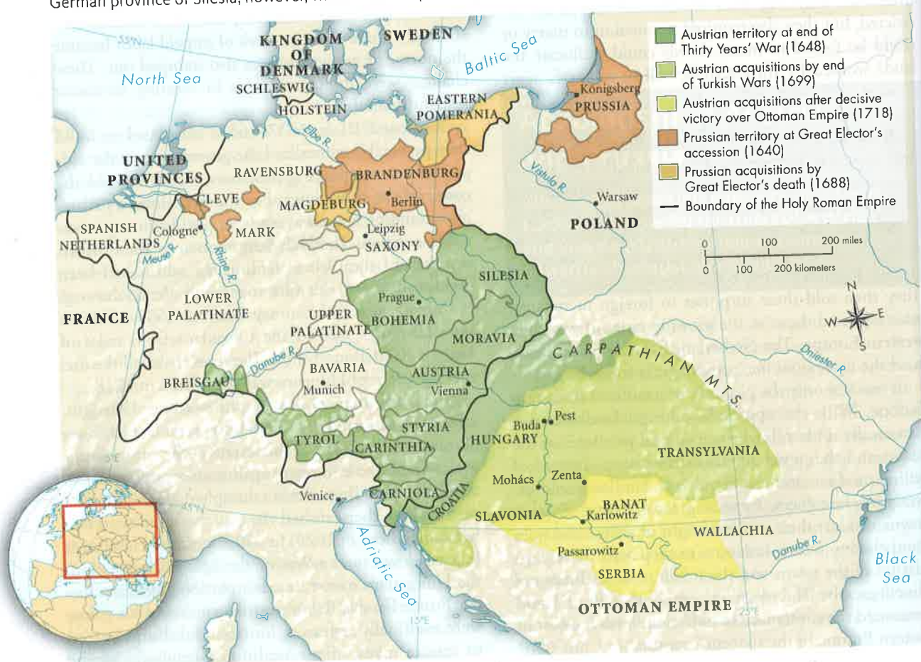
Map 15.3 The Growth of Austria and Brandenburg-Prussia to 1748 Austria expanded to the southwest into Hungary and Transylvania at the expense of the Ottoman Empire. It was unable to hold the rich German province of Silesia, however, which was conquered by Brandenburg-Prussia.

Frederick William profited from ongoing European war and the threat of invasion from Russia when he argued for the need for a permanent standing army. In 1660 he persuaded Junkers in the estates to accept taxation without consent in order to fund an army.