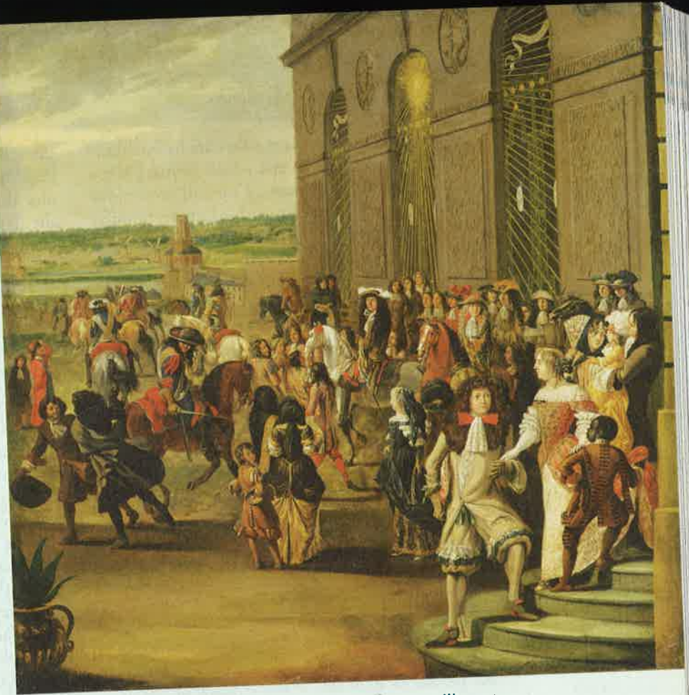
Louis XIV leading a tour of the extensive grounds at Versailles.