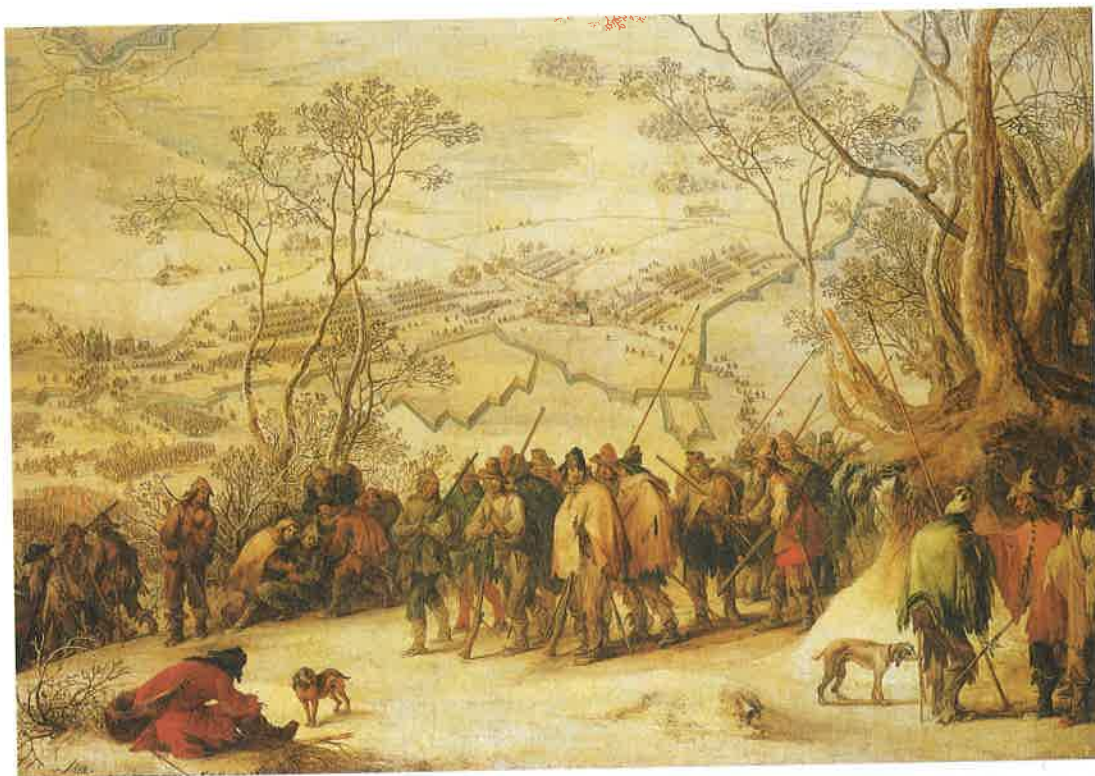
Spanish Troops The long wars that Spain fought over Dutch independence, in support of Habsburg interests in Germany, and against France left the country militarily exhausted and financially drained by the mid-seventeenth century. In this detail from a painting by Peeter Snayers, Spanish troops—thin, emaciated, and probably unpaid—straggle away from battle.

left the management of his several kingdoms to Gaspar de Guzmán, Count-Duke of Olivares. Olivares was an able administrator who has often been compared to Richelieu. He did not lack energy and ideas, and he succeeded in devising new sources of revenue. But he clung to the grandiose belief that the solution to Spain's difficulties rested in a return to the imperial tradition of the sixteenth century. Unfortunately, the imperial tradition demanded the revival of war with the Dutch at the expiration of a twelve-year truce in 1622 and a long war with France over Mantua (1628–1659). Spain thus became embroiled in the 'Thirty Years' War. These conflicts, on top of an empty treasury, brought disaster.