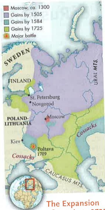
The Expansion of Russia to 1725

Although the new tsar successfully reconsolidated central authority, he and his successors did not improve the lot of the common people. In 1649 a law extended serfdom to all peasants in the realm, giving lords unrestricted rights over their serfs and establishing penalties