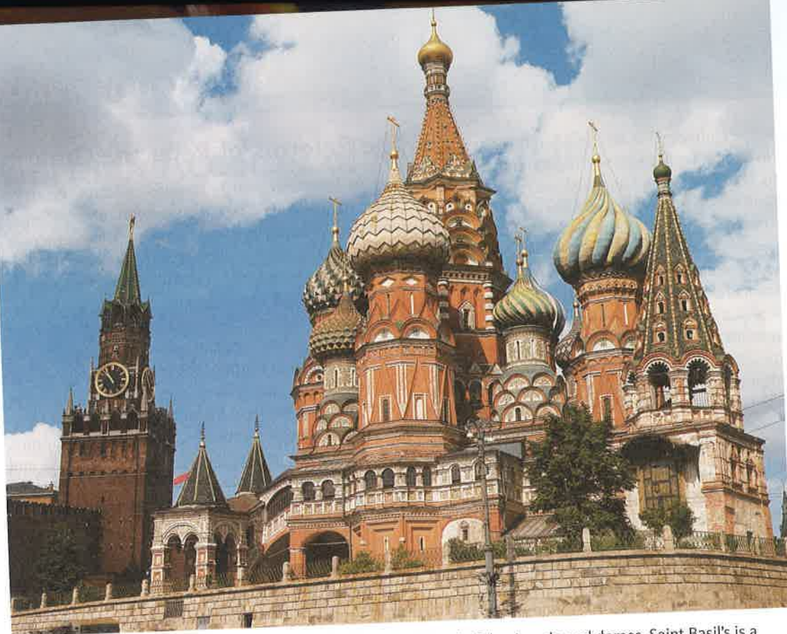
Saint Basil's Cathedral, Moscow With its sloping roofs and colorful onion-shaped domes, Saint Basil's is a striking example of powerful Byzantine influences on Russian culture. According to tradition, an enchanted Ivan the Terrible blinded the cathedral's architects to ensure that they would never duplicate their fantastic achievement, which still dazzles the beholder in today's Red Square.

in 1700, then turned on Russia. In a blinding snow-storm, his well-trained professional army attacked and routed unsuspecting Russians besieging the Swedish fortress of Narva on the Baltic coast. It was, for the Russians, a grim beginning to the long and brutal Great Northern War, which lasted from 1700 to 1721.