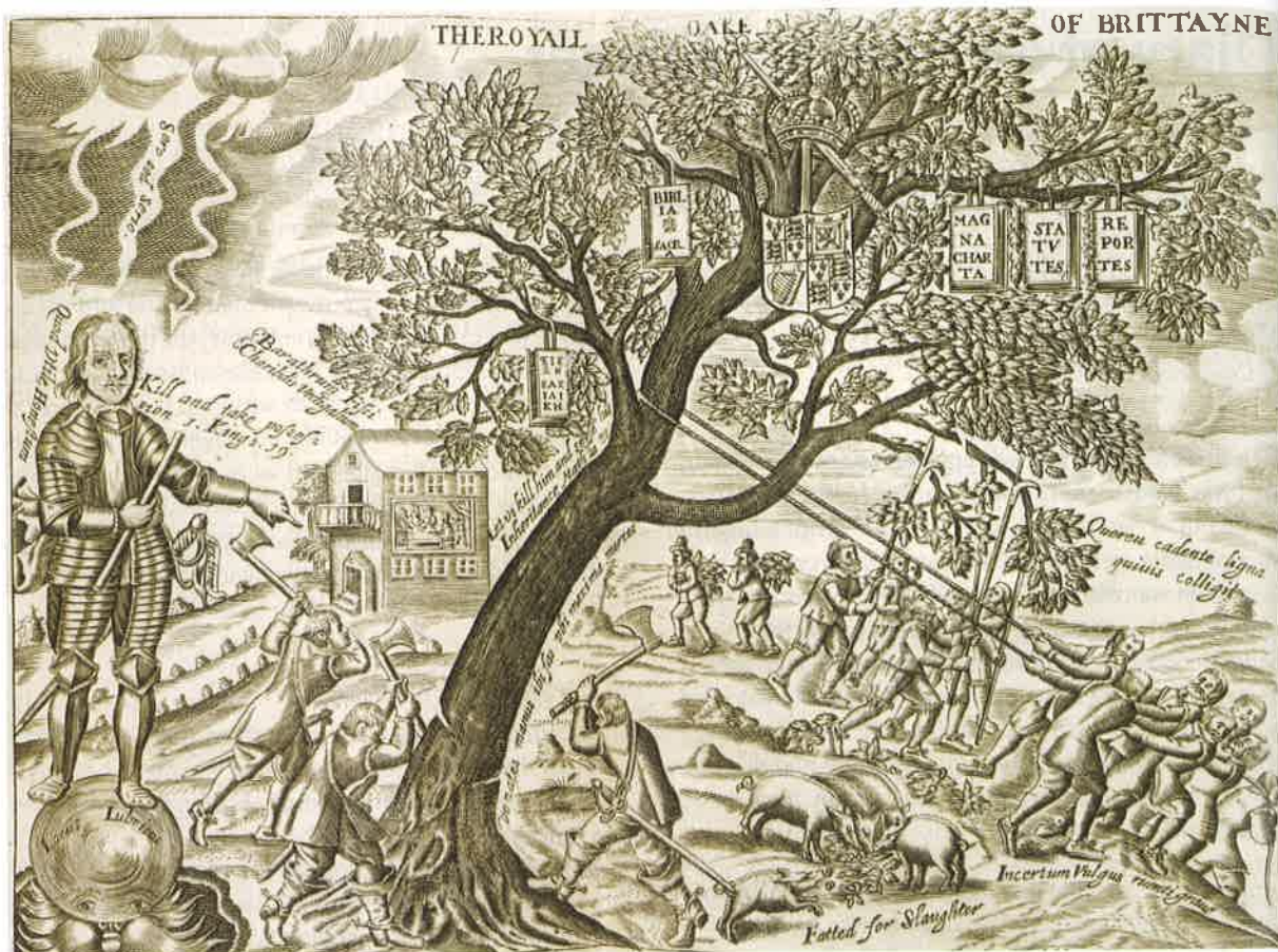
"The Royall Oake of Brittain" The chopping down of this tree, as shown in a cartoon from 1649, signifies the end of royal authority, stability, and the rule of law. As pigs graze (representing the unconcerned common people), being fattened for slaughter, Oliver Cromwell, with his feet in Hell, quotes Scripture. This is a royalist view of the collapse of Charles I's government and the rule of Cromwell.

England, and convert to Catholicism himself. When the details of this treaty leaked out, a great wave of anti-Catholic sentiment swept England.