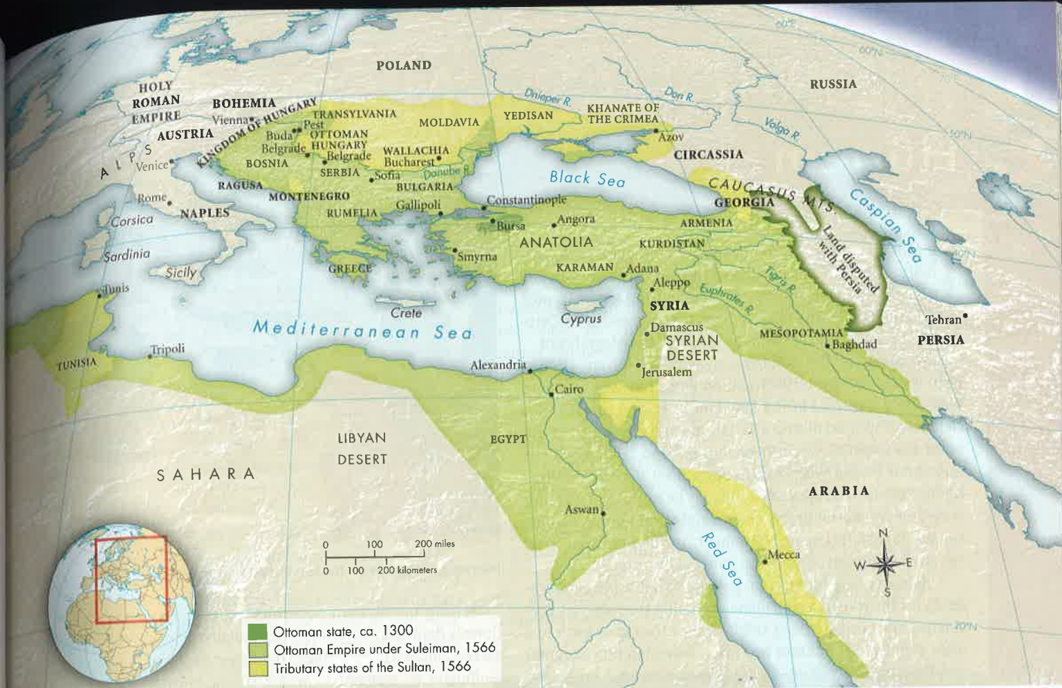
Map 15.4 The Ottoman Empire at Its Height, 1566 The Ottomans, like their great rivals the Habsburgs, rose to rule a vast dynastic empire encompassing many different peoples and ethnic groups. The army and the bureaucracy served to unite the disparate territories into a single state under an absolutist ruler.

wealthy, with the peasantry forced to do the manual labor.